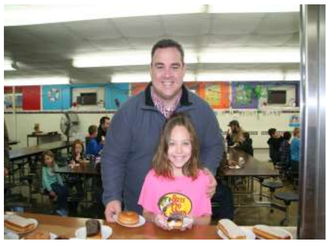
Donuts With Dads, Grandpas & Special Guests December 8, 2017