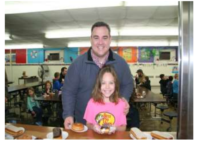
Donuts With Dads, Grandpas & Special Guests December 8, 2017