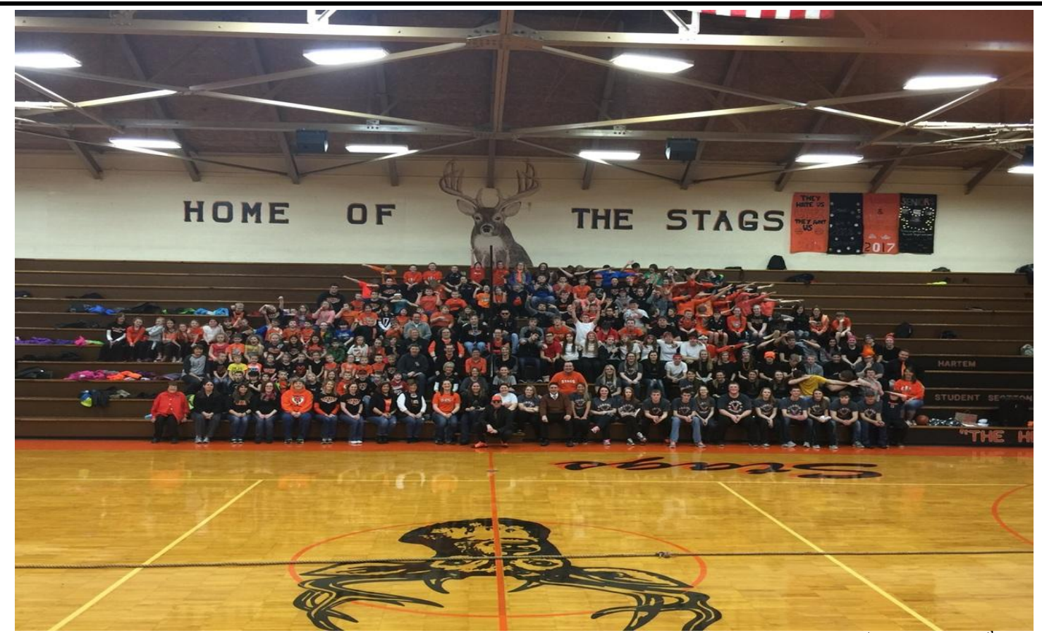
The Hartsburg-Emden school district celebrated Basketball Homecoming week February 1<sup>st</sup> - February 5<sup>th</sup>. The week ended with an all-district assembly. Congratulations to the Seniors for winning the spirit trophy!

Hartsburg-Emden C.U.S.D. #21 400 West Front Street Hartsburg, IL 62643